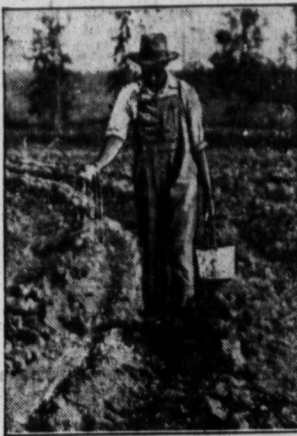
Side-dressing cotton on Moss farm, Soso, Miss.